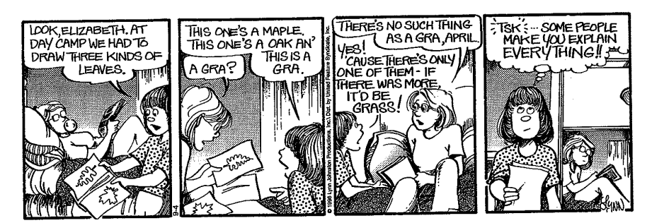
FOR BETTER OR WORSE reprinted by permission of United Feature Syndicate, Inc.

Children are overzealous grammarians not only in applying inflections in their own speech but also in analyzing them in the speech of others. They have little choice. Children are never given grammar lessons presenting -ed or -s with lists of stems to conjugate or decline; they must mentally snip the suffixes out of the full, inflected words they hear in conversation. As they are figuring it out, they occasionally snip too eagerly and come out with strange back-formations: